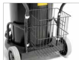
OPTIONAL TOOL HOLDER