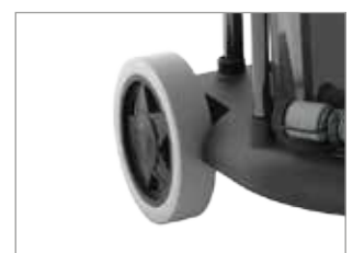
LARGE REAR WHEELS WITH TYRES