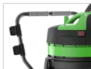
TROLLEY WITH HANDLE