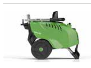
COLLAPSIBLE HANDLE FOR COMPACT STORAGE AND EASY TRANSPORT