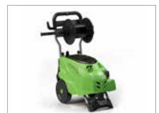
REMOVABLE COVER, AND EASY OIL FILL-EMPTY SYSTEM FOR A RAPID MAINTENANCE