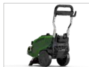
NEW STORAGE SPACE FOR ALL EQUIPMENT AND ACCESSORIES