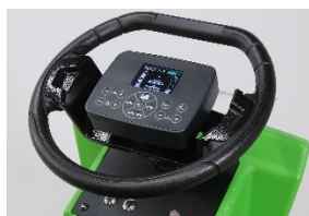
Sports steering wheel