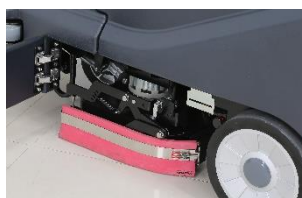
Side splash guard